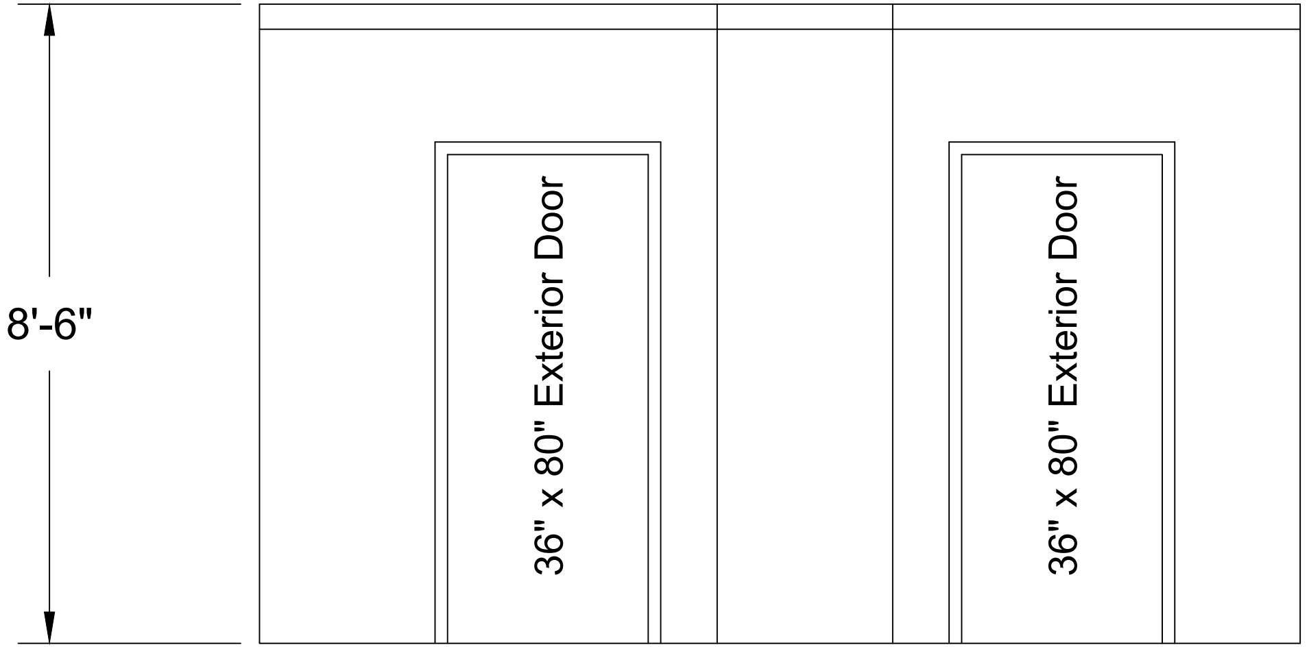
Front View (exterior)